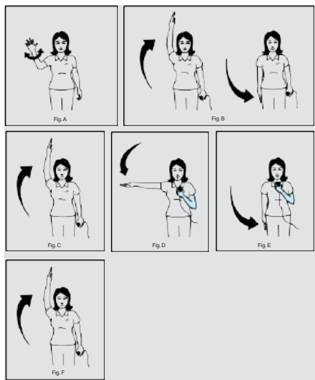
Figure 2. BACKSTROKE START.