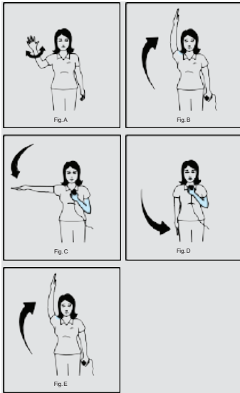
Figure 1. FORWARD START.