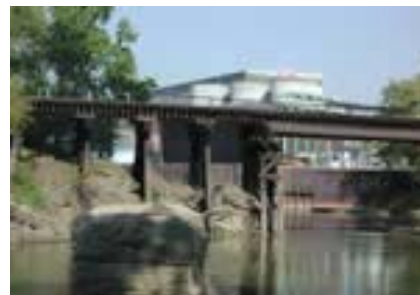
The final leg of the swim takes you under a variety of bridges and into the heart of downtown Cleveland.

That was the good news, as the last 7 miles of your swim will be in the Cuyahoga River. In 1969, Time Magazine described the Cuyahoga as a river that "oozes rather than flows" and in which "a person does not drown but decays." Oil slicks on the river's surface had again caught fire and the river became a stark symbol of water pollution. The burning river captured the attention of the nation and became a rallying point for passage of the Clean Water Act.