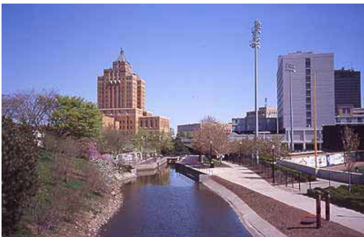
The Canal flows through downtown Akron.

This virtual swim will take place in the Ohio and Erie Canal which is now obsolete, but when it first opened in 1827, it served as the primary transportation artery between Akron and Cleveland. The original canal connected Lake Erie at Cleveland with the Ohio River at Portsmouth, Ohio, and measured 309 miles in length. Our virtual swim will be the 42 locks of the canal's northern section between Akron and Cleveland, a distance of 40.5 miles. You will start your swim at Summit Lake in Akron - this is the north-south continental watershed divide. Waters flow north from this point. The swim will be entirely "downstream" as Akron's elevation is 395 feet above Lake Erie.